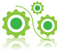
Paper printed using 100% certified renewable electricity