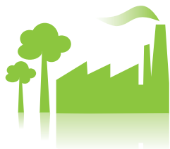
Paper manufactured using 100% certified renewable electricity

Green-e certifies printers and paper lines that use renewable energy like solar, wind, and biomass energy. When your business produces printed materials, choosing both a Green-e printer and paper line will reduce your companies impact and communicate your commitment to sustainable printing.